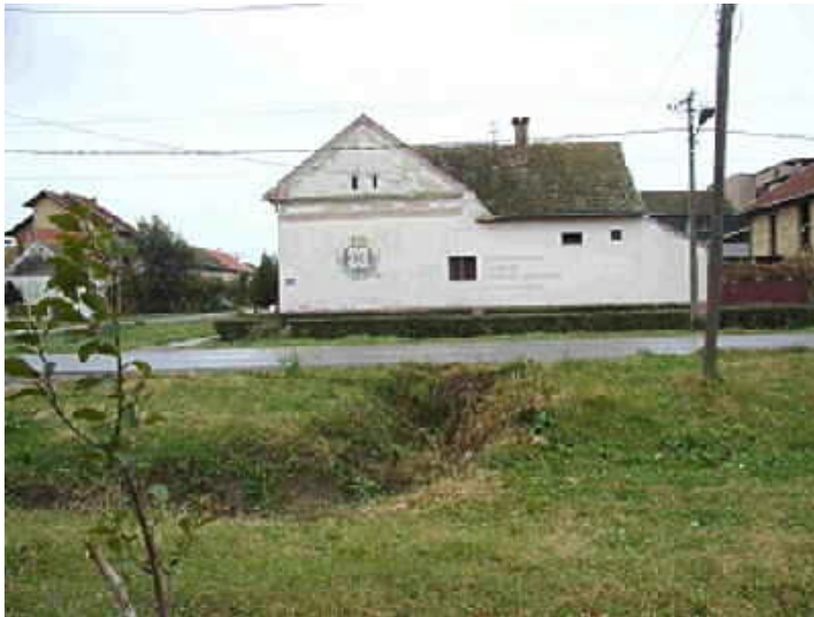
Picture 19 - The back of house number 183 as seen from the Cross Lane.

The stable which had been attached on the right side has been pulled down in the meantime. Only one room has a large window facing the street. (It is the “famed” observation window in Old Jarek of “Eckrosibüsel”.)