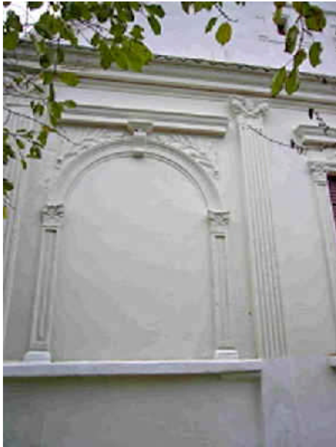
Picture 6 - the half pillars and the round arch on house no. 176