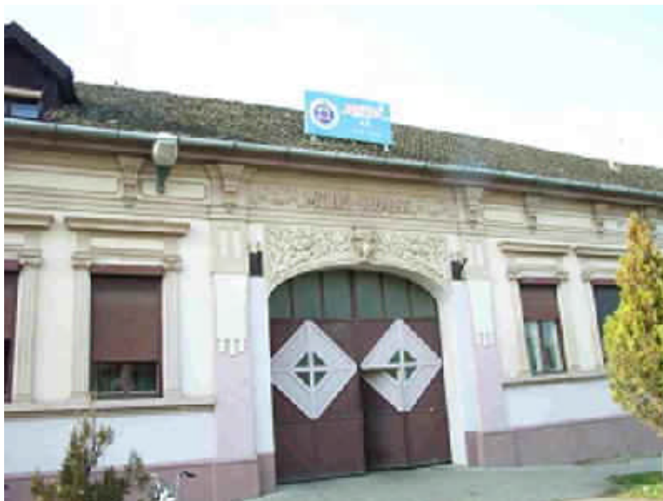
Picture 29 - House no. 183 in the Water Lane. The ornamentation above the gate is the same as at the catty-cornered house no. 211. The year of construction may also be 1912.