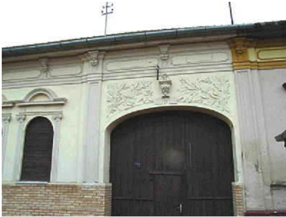
Picture 34 - Gate of house no. 73 in the Cross Lane, which was built about 1912.