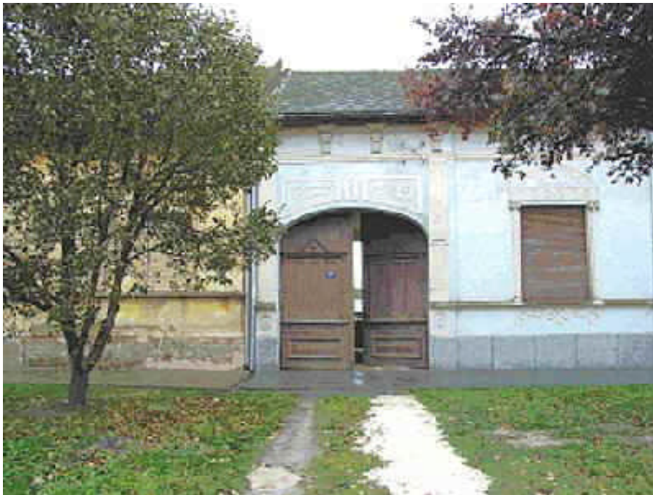
Picture 41 - Door and window with stucco relief at house no. 143 in Main Lane (constructed about 1923) as a half-transverse house on a small parcel attached to the neighbouring house (house no. 144).