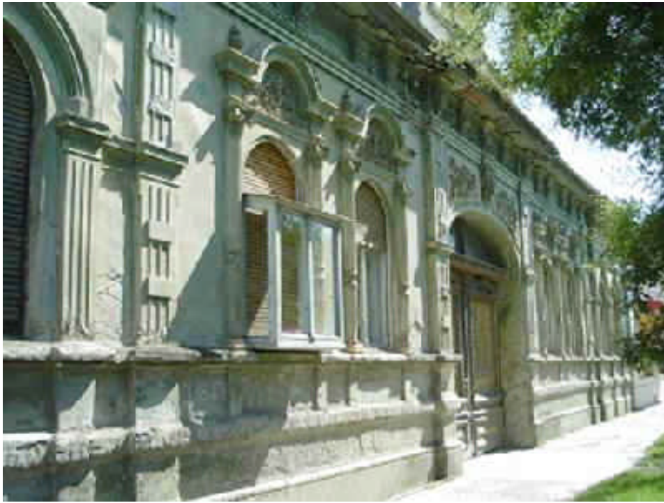
Picture 24 - . . . a transverse house in the conform construction (house no. 148) . . .