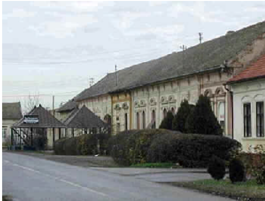
Picture 20 - Two identical built transverse houses each with 7 windows in the Cross Lane in direction to railway station (house no. 73 and 74).

The division into front yard and farmyard was the same, too. The Main, Hospital and Water Lanes had houses of this type exclusively. Often two neighbouring houses were identical.