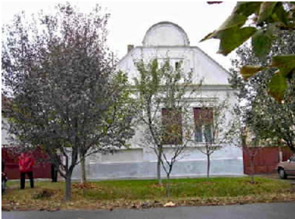
Picture 5 - A longitudinal house in the Hospital Lane (house no. 176). The door has been blocked up and therefore the gable is emblazed with half pillars and a round arch.