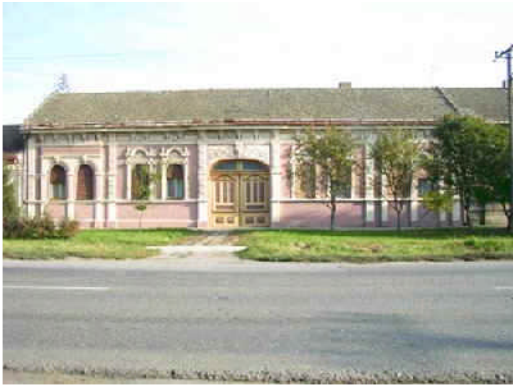
Picture 22 - A transverse house in the Main Lane (house no. 149) with 4 windows on each side and . . .