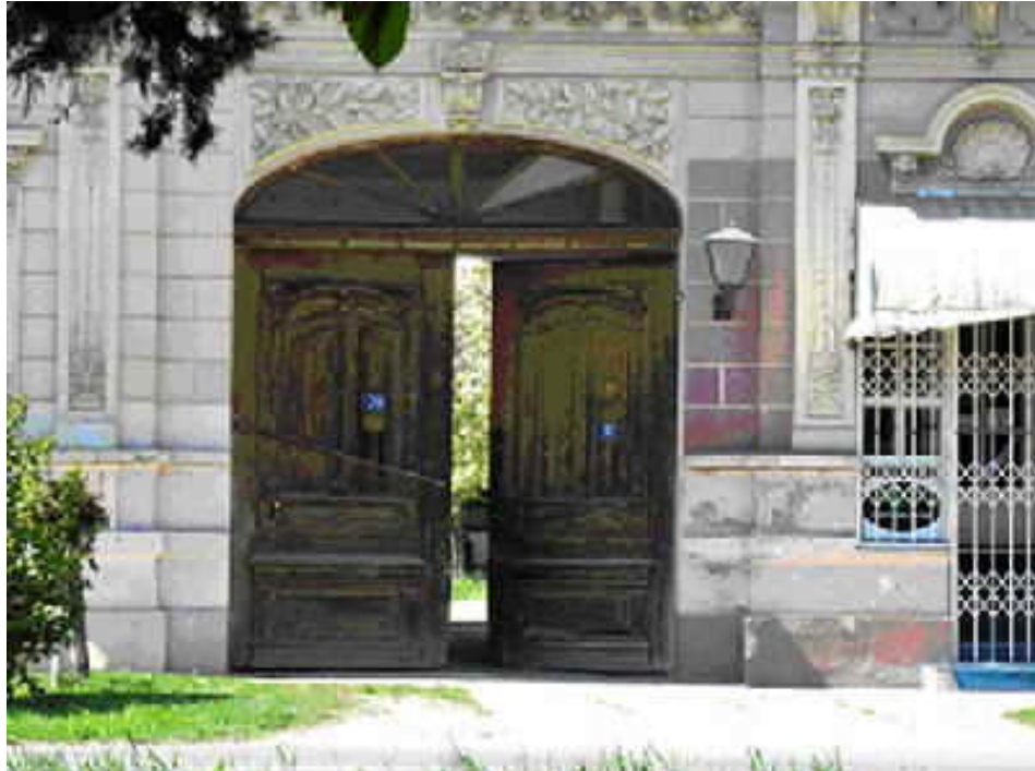
Picture 35 - An identical Gate at house no. 75 in the Cross Lane, and the same year of construction like house no. 73.