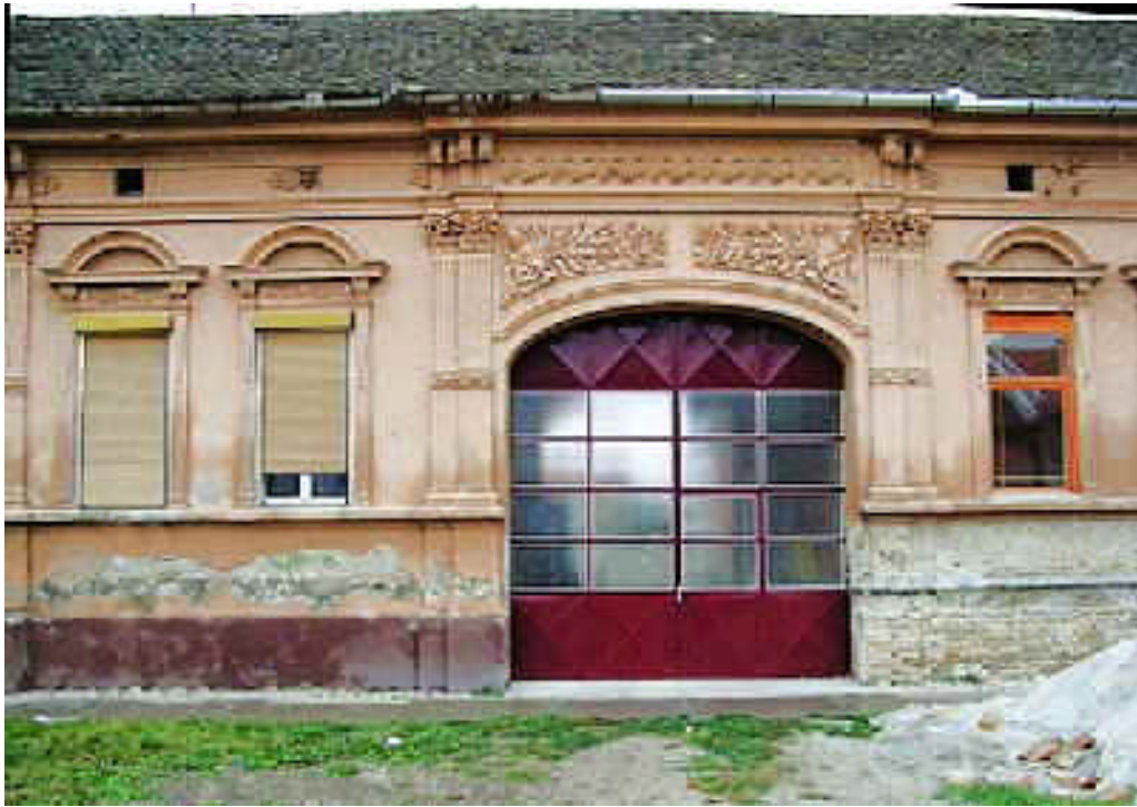
Picture 32 - The gate of house no. 187 in the Hospital Lane.