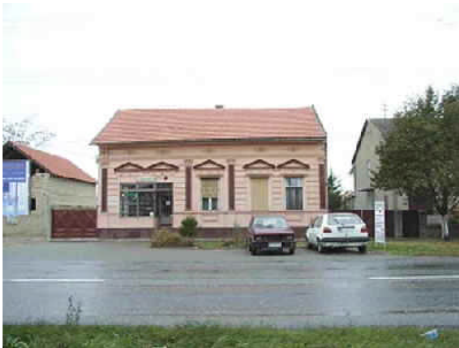
Picture 27 - . . . and one year later (in 2006) after a brake there remains only a five-window house (house no. 109).

The windows and gates of all these transverse houses are decorated with imaginative stucco ornamentation. Occasionally the year of the construction and the name of the owner are still to be found above the gates.