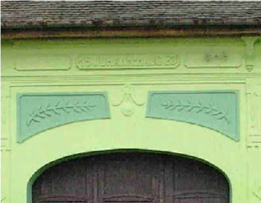
Picture 30 – House no. 202 in the Hospital Lane, a “modern“ renovated house from 1923.

The following photos taken at Jarek (in 2005 and 2006) show some more details of gates and windows: