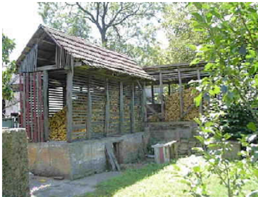
Picture 9 - A “hambar” (or a“tschardak”) in the back yard, which was used to dry corn.

The old sites were almost 100 m long. Through a small door or a gap in the fence the neighbour's garden could be reached and through his site the parallel lane; of course this way could only be used, if there were good relations between the neighbours.