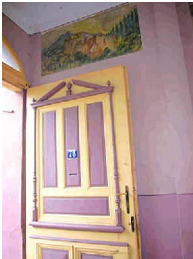
Picture 36 - Fresco in the entrance of great housegate of house no. 149 in the Main Lane.