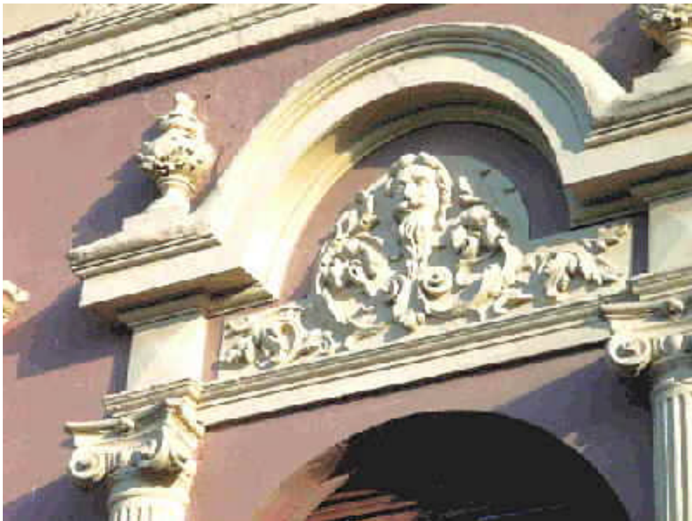
Picture 39 - Decoration around windows at house no. 149 in the Main Lane.