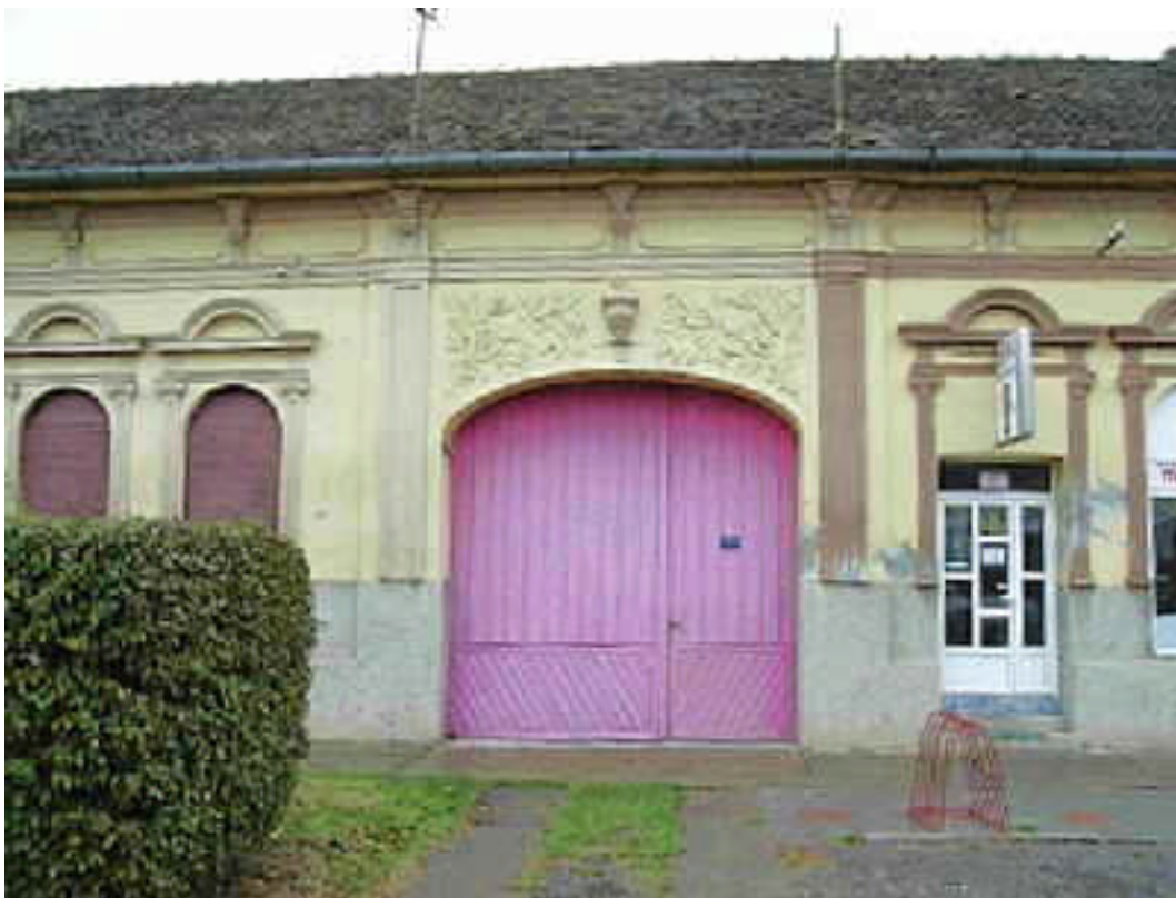
Picture 33 - Entrance gate of house no. 103 in the Main Lane.