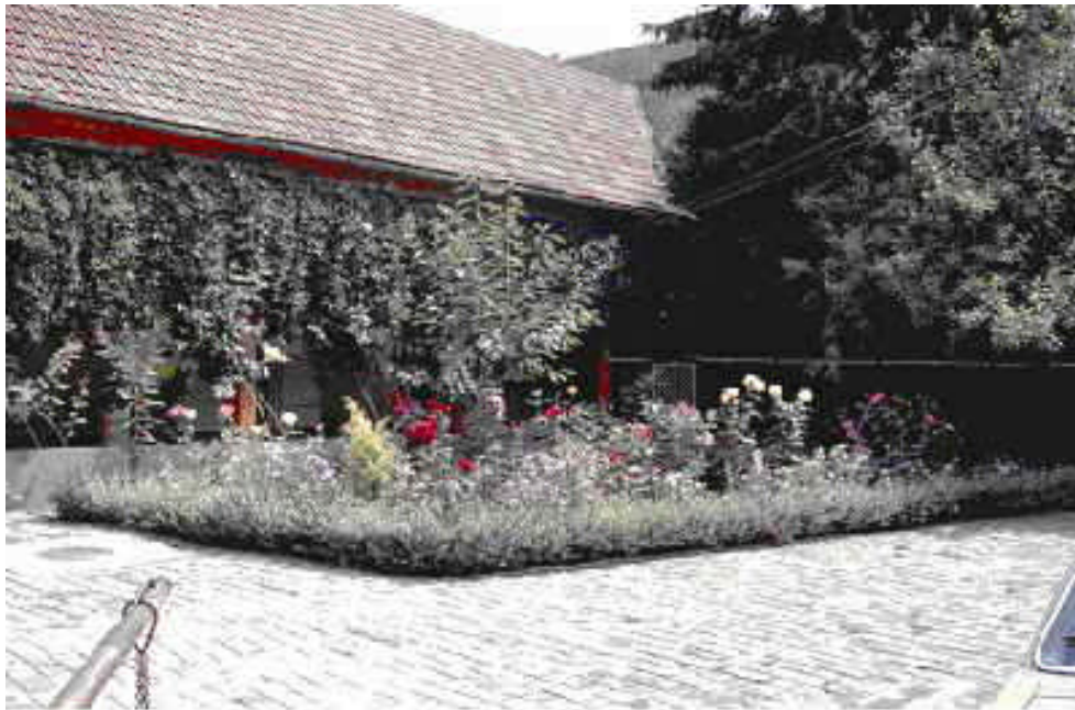
Picture 10 - A flower garden in the angle between the front and back house (2005).

The half traverse house was frequently found in the three oldest lanes of Jarek, the Main Lane, the Water Lane and the Hospital Lane.