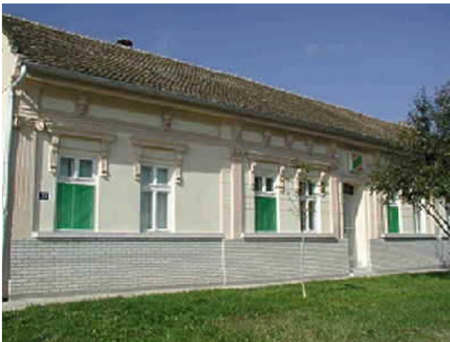
Picture 13 - At the corner of Railway Lane and Water Lane (house nr 14).

The present multi-coloured coating is not identical with the original appearance of the house until 1944. At that time almost all the houses were whitewashed. Every year before 'Kerweih' the women painted the facades with slaked lime.