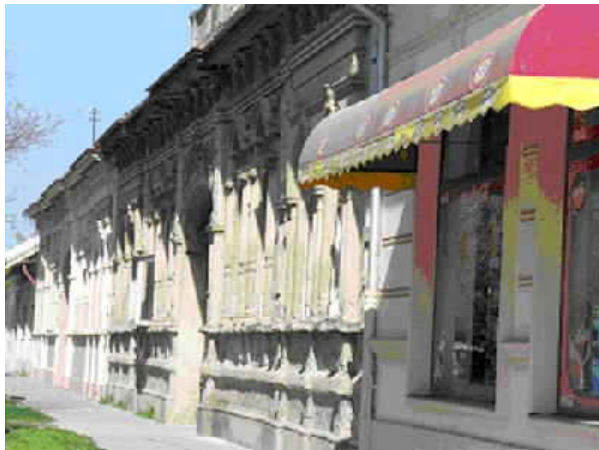
Picture 21 - Also two identical transverse houses in the Main Lane (house no. 148 and 149).