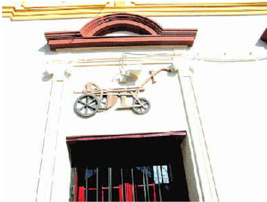
Picture 40 - A window at house no. 73 in the Cross Lane (wich was once a workshop of a wainwright).