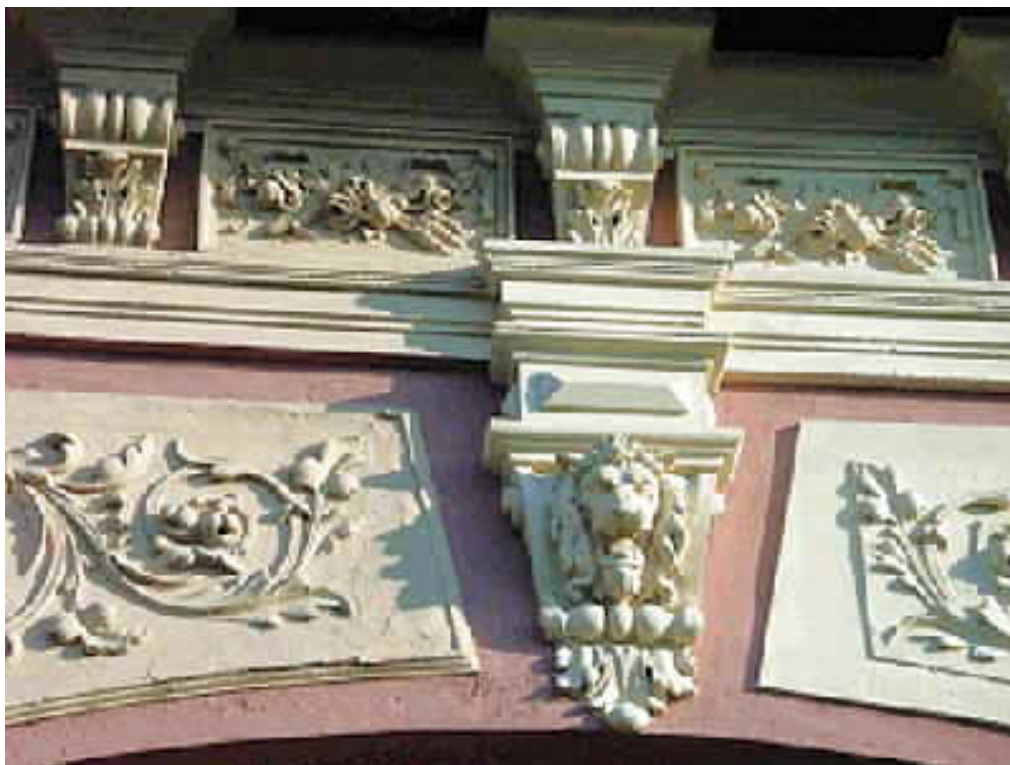
Picture 23 - . . . with wonderful stucco ornamentation above the great house gate . . . and in the neighbourhood . . .