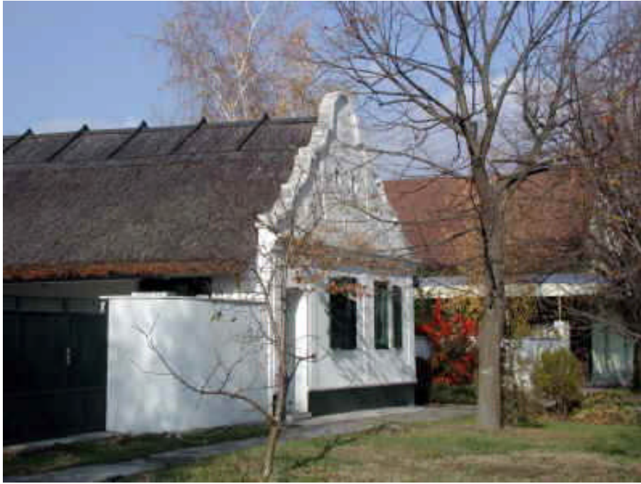
Picture 2 - An old longitudinal house with reed-covered roof.

This very beautiful and well-kept house is to be found at Temerin, the neighbouring village of Jarek, which had a high Hungarian population. The protruding gable is particularly beautiful and shows a style no longer existent at Jarek.