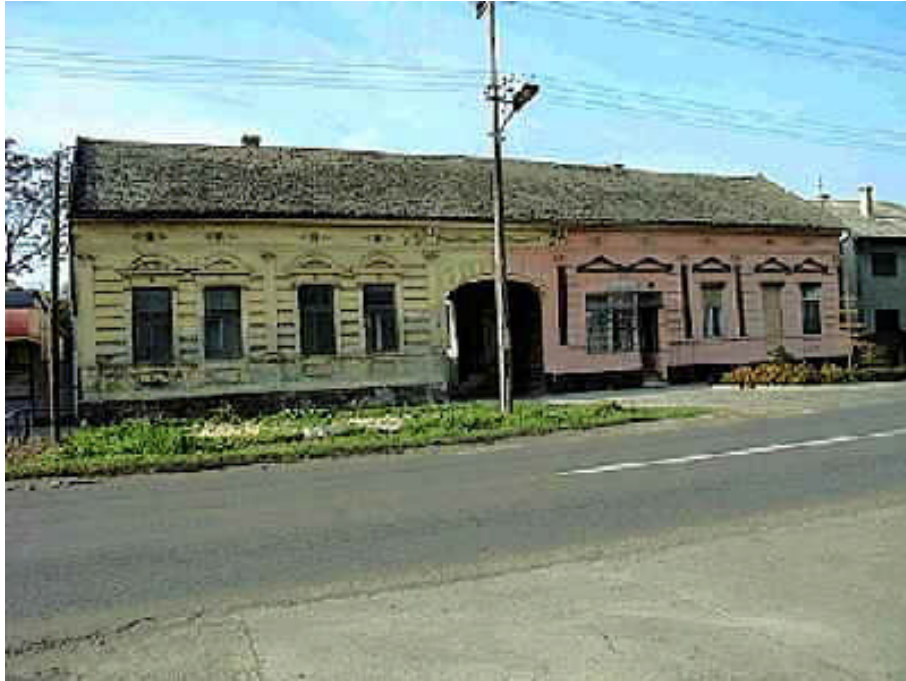
Picture 26 – A beautiful nine-windows house demolition Main Lane (house no. 109) in the year 2005 . . .