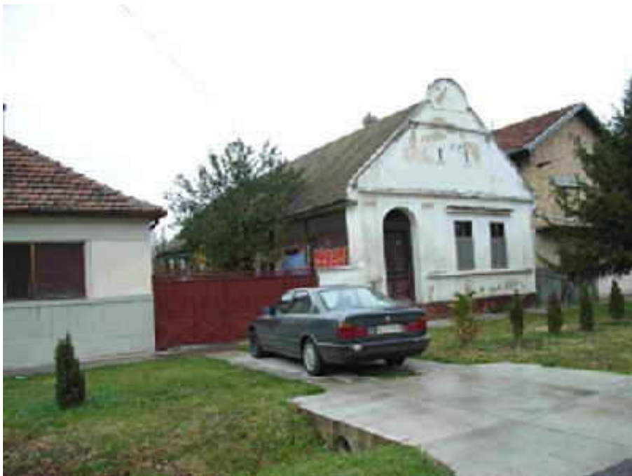
Picture 3 - longitudinal house in the Water Lane with a very simple created gable.

The following 4 photos of longitudinal houses were all taken at Jarek in 2005 and 2006.