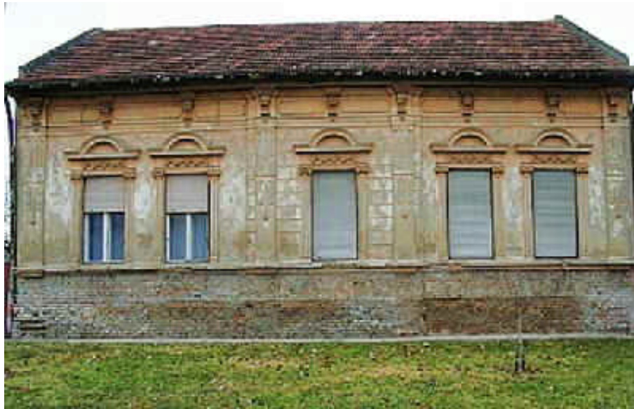
Picture 14 - The transverse house in the Water Lane.

Though this house has not been painted for more than 60 years the structural fabric is still in good condition and gives an impression of the great variety of' stucco ornamentation.