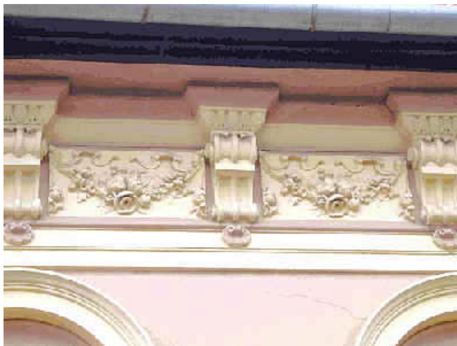
Picture 37 - The frieze at house no. 149 in the Main Lane.