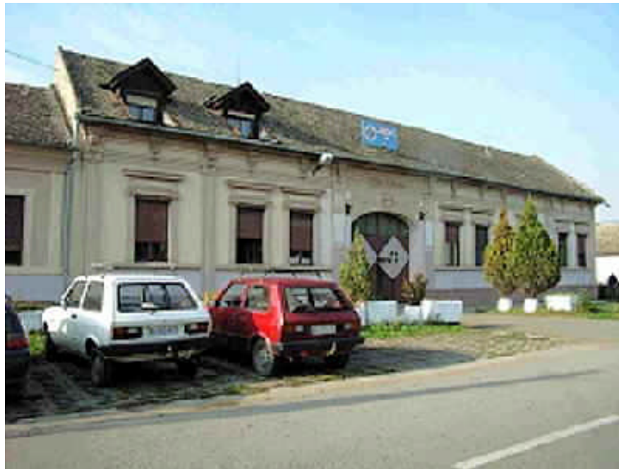
Picture 18 – A transverse house at the corner of Hospital Lane and Cross Lane (number 183) with eight windows.