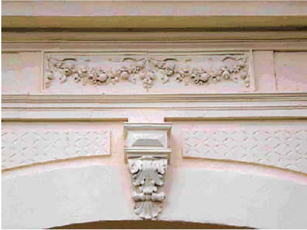
Picture 38 - Another beautiful frieze above an entrance-gate in the Hospital Lane.