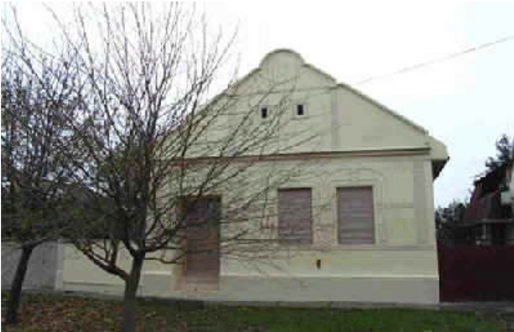
Picture 4 - A longitudinal house in the Water Lane with a wonderful stucco relief around the windows. At the gable you can see the year of building 1932.