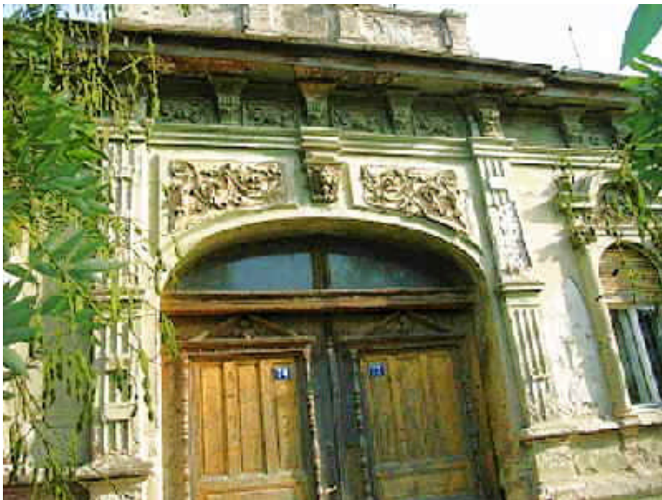
Picture 25 - . . . which has the same stucco ornamentation above the great house gate, but now sadly in a derelict state.