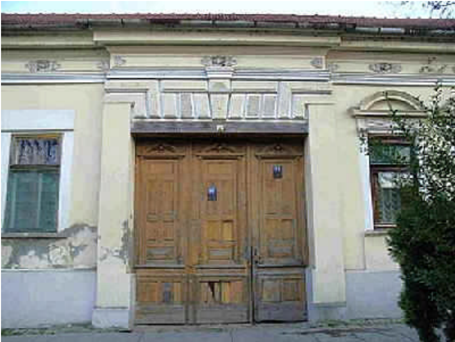
Picture 31 - A great housegate in the Main Lane.