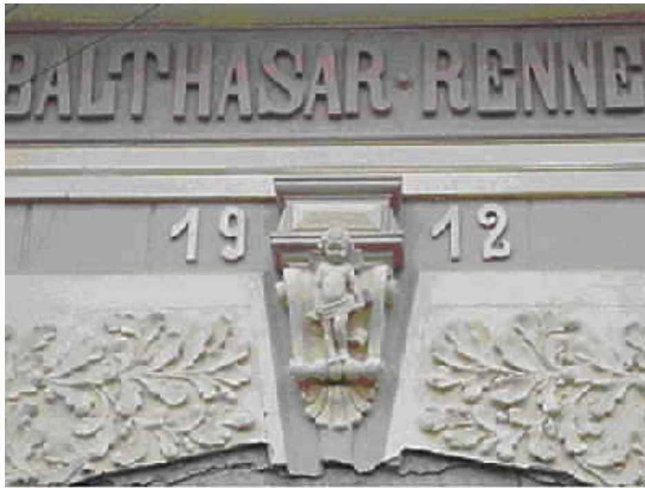
Picture 28 - The name and the building-year above the great house gate from house no. 211 in the Water Lane.