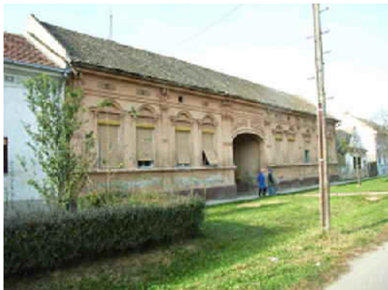
Picture 17 - A nine-window house in the Hospital Lane (house no. 187).

This construction type is the consistent continuation of the half-transverse house. It was destined for several generations; the integrated retirement house was attached to the main building. The whole site of 15 klafters (about 28 m) bordering on the lane was built on. On the one side there was the main-building with 5 to 6 windows, followed by the integrated gate opening a passage to the front yard. Beside the gate there was the 'retirement' house with at least two, but frequently 3 or even 4 windows. Unfortunately there are only two of those formerly large and splendid 'nine-window houses' left at Jarek.